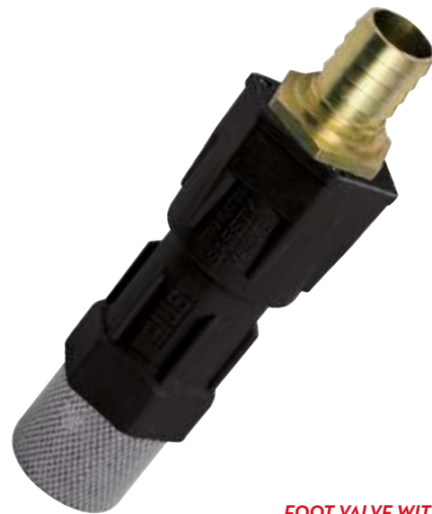
FOOT VALVE WITH FILTER