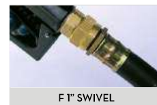
F 1" SWIVEL