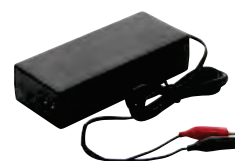
Charger for versions with battery