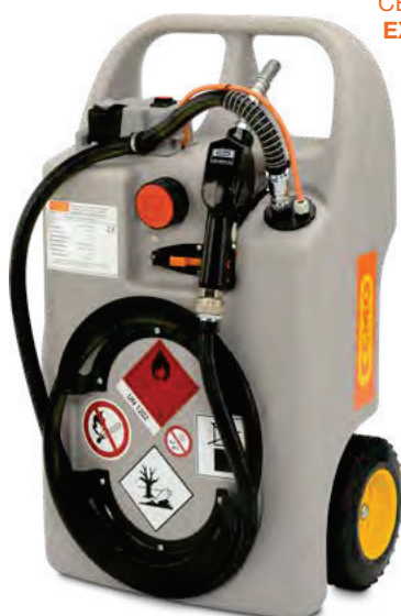
Diesel trolley 60 L with 12 V pump CENTRI SP30 and battery