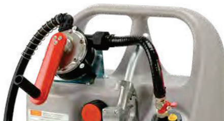
Diesel trolley 100 L with crank pump