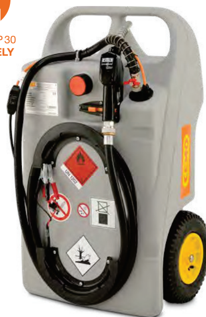
Diesel trolley 100 L with 12 V pump CENTRI SP30