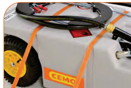
recesses for lashing straps

Integrated dispensing nozzle holder with lock.