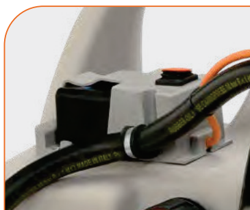
LiFePO 4 battery

Mobile fuelling on site used to be a tricky topic. Apart from the question of transport, smaller quantities of fuel were easily spilled, depending on whether tank connections, funnels or hoses were used. The new CEMO tank trolleys are a completely different story. They deliver up to 100 litres of diesel fuel or petrol on site in absolute safety and in accordance with regulations.