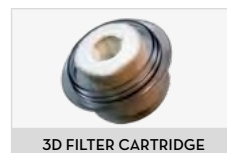
3D FILTER CARTRIDGE