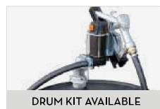
DRUM KIT AVAILABLE