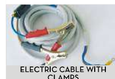
ELECTRIC CABLE WITH CLAMPS